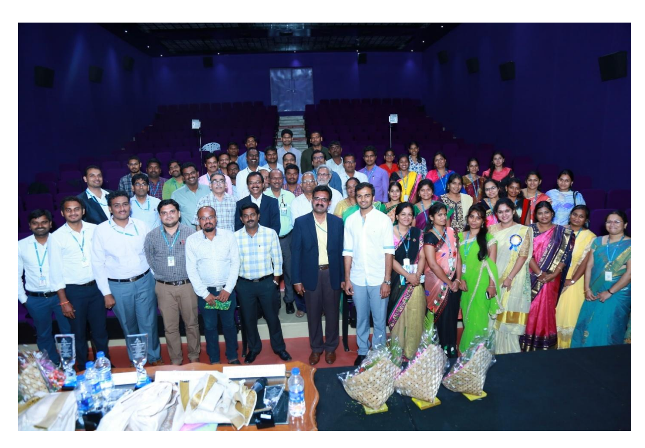
Participants Group Photo FDP @ SREYAS