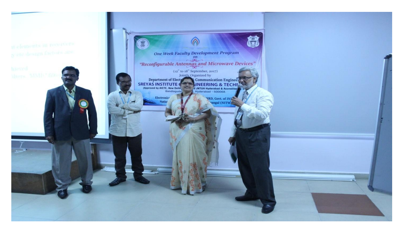
DAY 5 – AFTERNOON SESSION BY DR. Y HEMALATHA, SCIENTIST - G, MICROWAVE WING - 2, DLRL ON RF RECEIVER TECHNOLOGIES