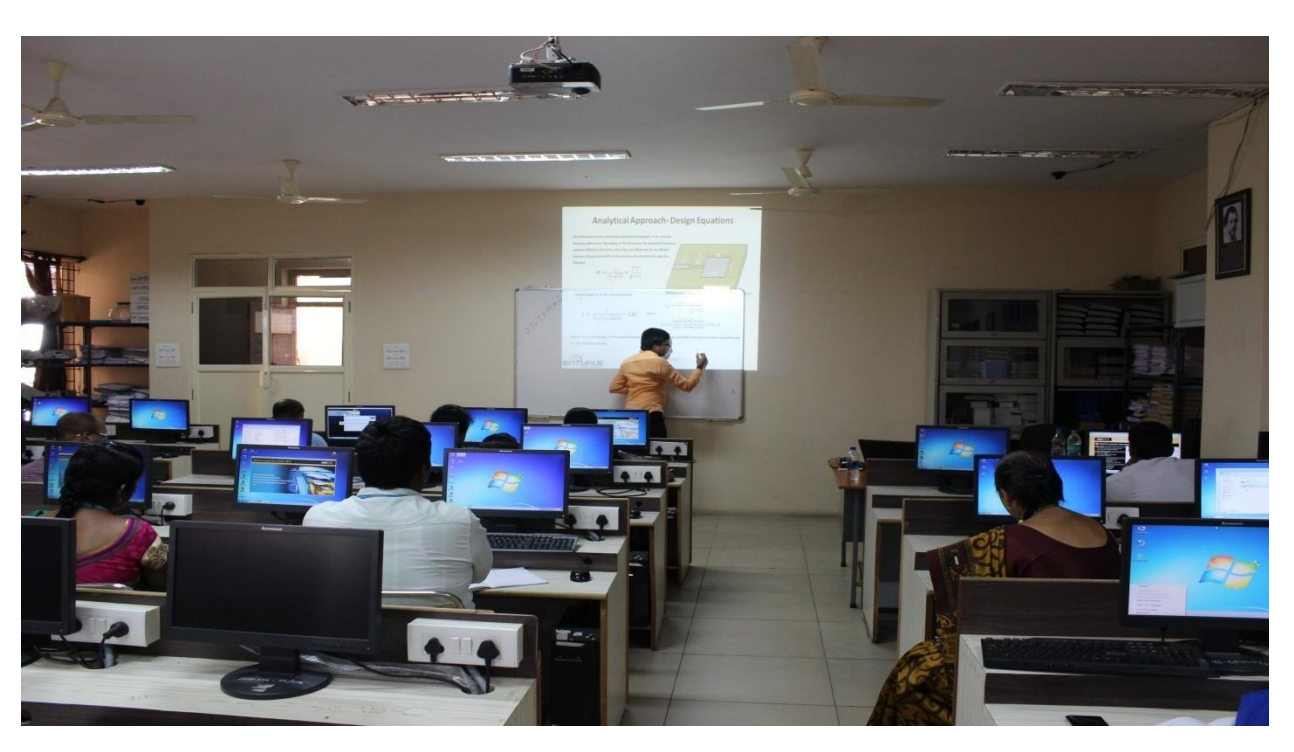
DAY 4 – SESSION BY K KAVIARASU, DESIGN ENGINEER, ANSYS ON HIGH FREQUENCY STRUCTURE SIMULATOR (HFSS) SOFTWARE