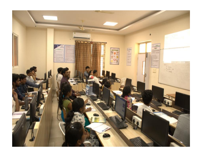
CSE LAB: AB-302B