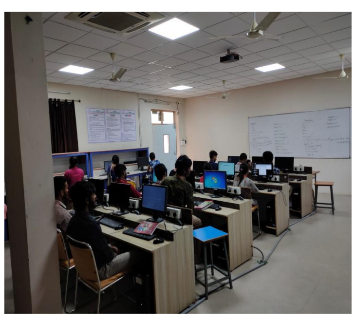
EMBEDDED LAB SYSTEMS