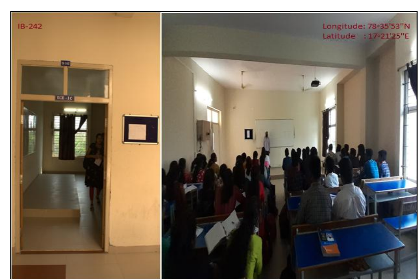
I ECE C