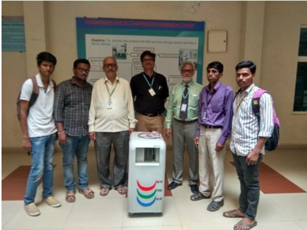
R & AC Incubation center staff with developed product R-134A

(Approved by AICTE, New Delhi | Affiliated to JNTUH, Hyderabad | Accredited by NAAC) Hyderabad | PIN: 500068