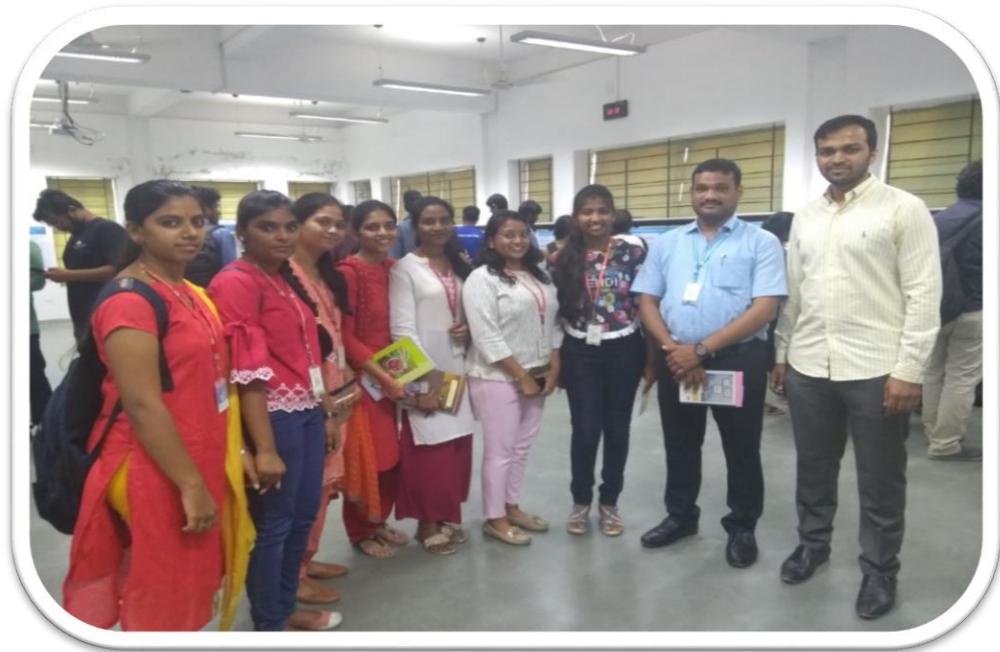
Training at Center for signal processing

(Approved by AICTE, New Delhi | Affiliated to JNTUH, Hyderabad | Accredited by NAAC) Hyderabad | PIN: 500068