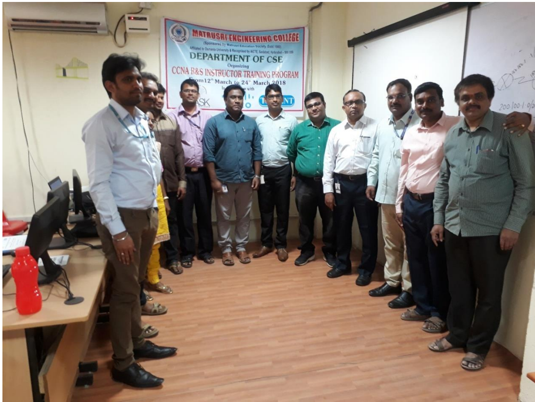
CISCO NETWORKING ACADEMY SUPPORT CENTRE TRAINING FOR INSTRUCTORS

(Approved by AICTE, New Delhi | Affiliated to JNTUH, Hyderabad | Accredited by NAAC) Hyderabad | PIN: 500068