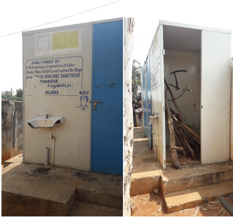
Toilets are not in use