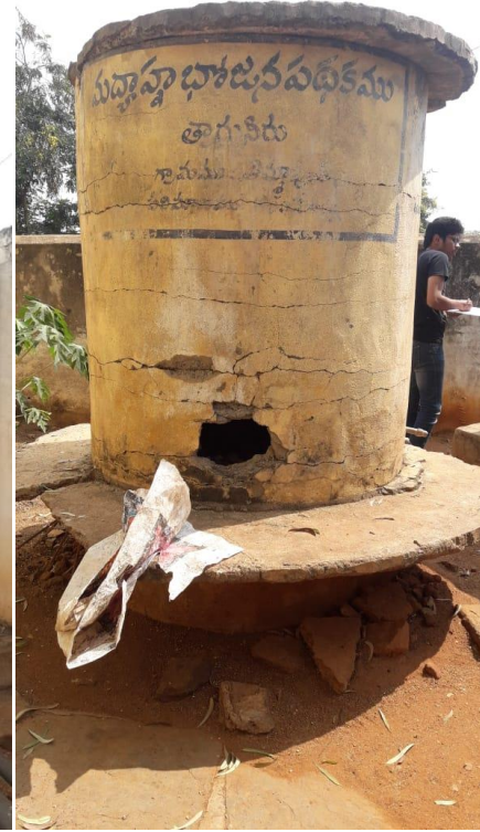
position of drinking water tank