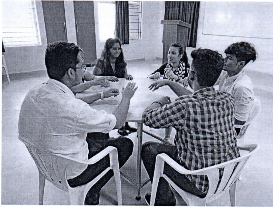
Students participating in Debate session