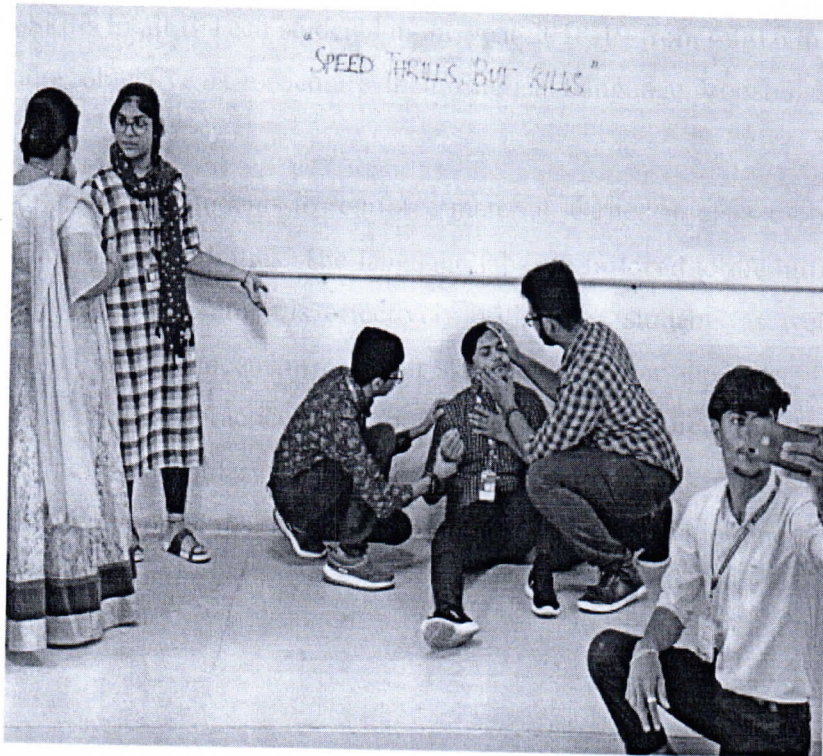
Students enacting in advertisement activity

Language lab allows students to reinforce material learned in class by putting them into practice through interactive activities. The language labs are tailored to the individual needs of students. The Language Laboratory is effectively utilized by students as well as the faculty members for various self-enhancement and soft skill development activities. The students and faculty can watch videos, practice their language skills- pronunciation through a speech recognizer, learn new vocabulary, and also students participate in JAM session, Mock Interviews, Oral Presentation Skills, Debates, Group Discussion Activities and Role Plays.