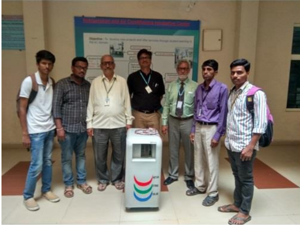
R & AC Incubation center staff with developed product R-134A